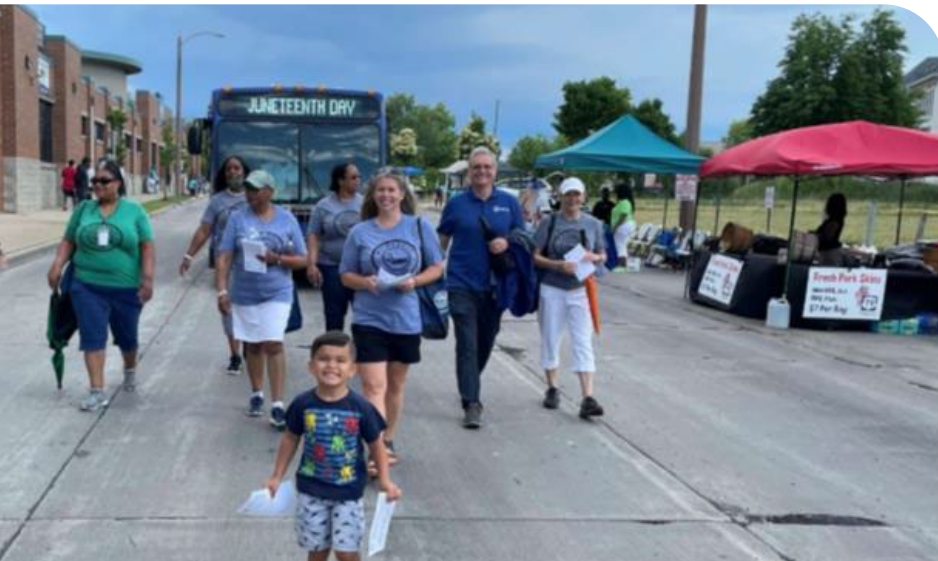
TEAM MCTS MARCHES IN THE 50TH ANNUAL JUNETEENTH DAY PARADE ON JUNE 19, 2021.

Watch for MCTS in Milwaukee's 51st Annual Juneteenth Parade on Sunday, June 19 starting at 9:00 a.m. The parade route begins near 17th & Atkinson Avenue then onto Dr. Martin Luther King Drive to Locust Street. You can also watch the parade live on Milwaukee's TMJ4 from 9 a.m. to 11 a.m. MCTS is a proud sponsor and supporter of this annual event, which is among the longest running Juneteenth Day celebrations in the U.S.